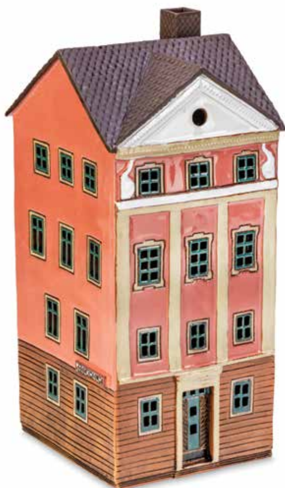
SW 05 BIG 28 cm