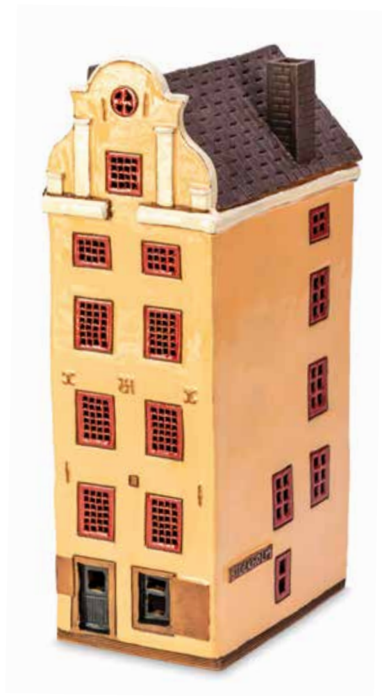
SW 02 BIG 24 cm