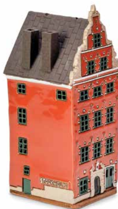
SW 01 18 cm