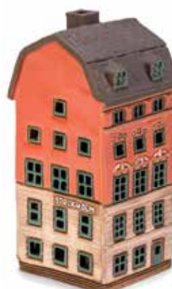
SW 06 MINI 11 cm