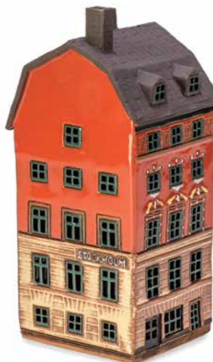
SW 06 18 cm