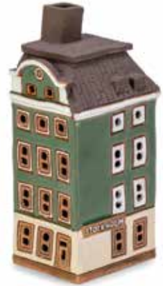
SW 07 MINI 11 cm