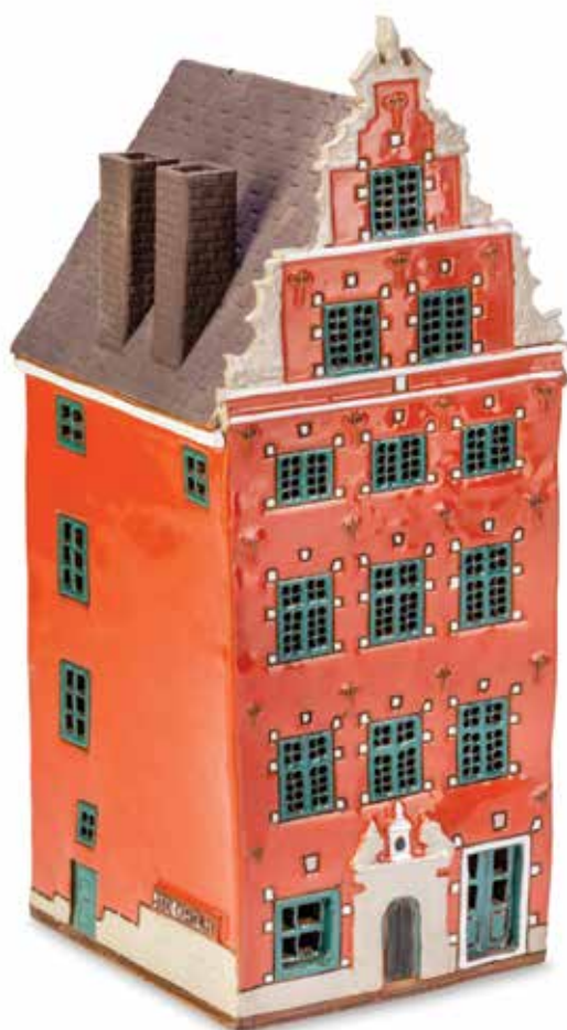
SW 01 BIG 27 cm