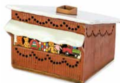
MARKET HOUSES 7 cm