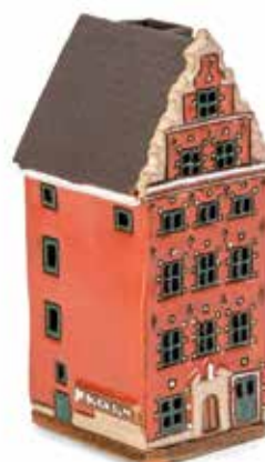
SW 01 MINI 11 cm