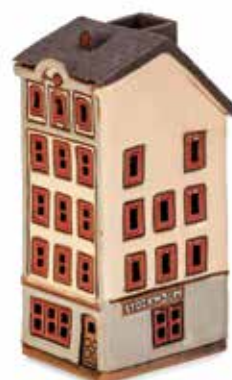
SW 04 MINI 10 cm