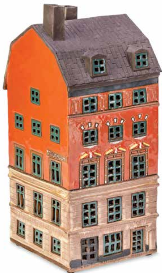
SW 06 BIG 27 cm