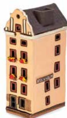
SW 02 MINI 10 cm