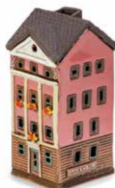
SW 05 MINI 10 cm