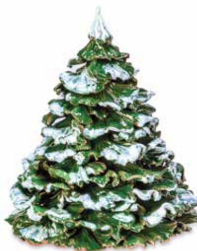
CHRISTMAS TREE 13 cm