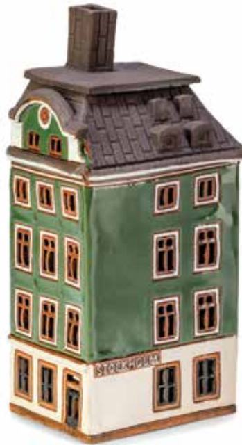
SW 07 17 cm