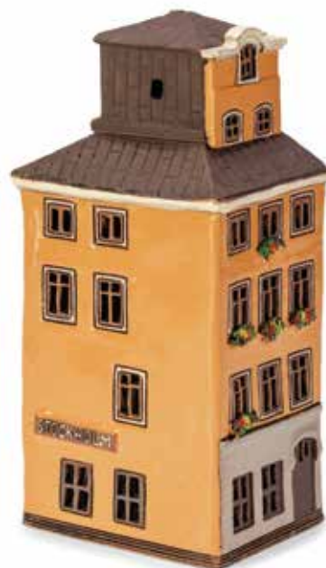
SW 03 17 cm