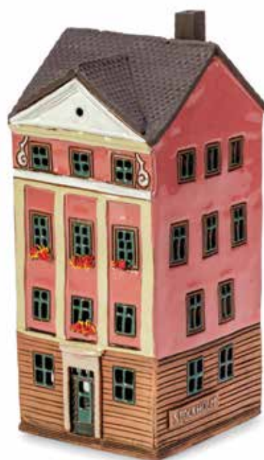
SW 05 17 cm