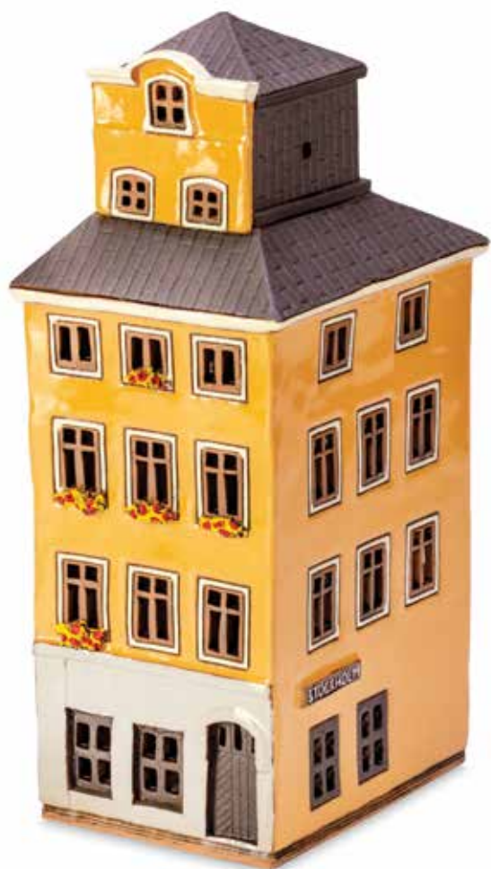
SW 03 BIG 25 cm