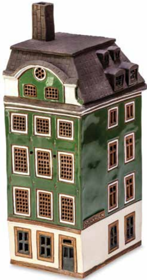
SW 07 BIG 26 cm