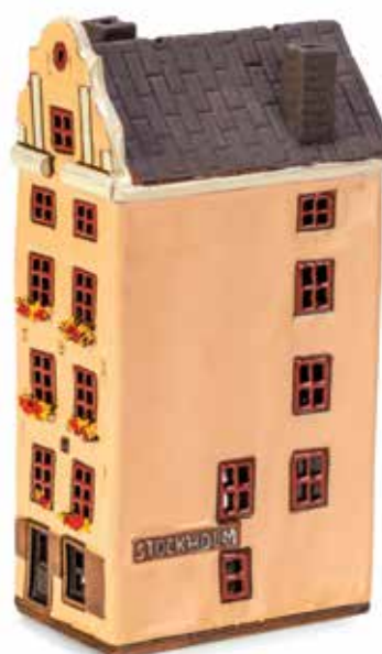
SW 02 16 cm