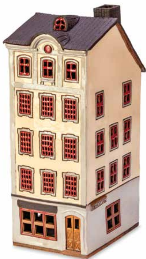
SW 04 BIG 25 cm