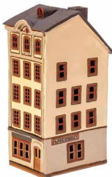
SW 04 16 cm