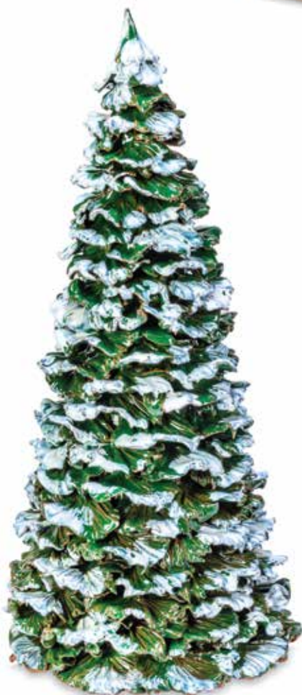
CHRISTMAS TREE BIG 28 cm