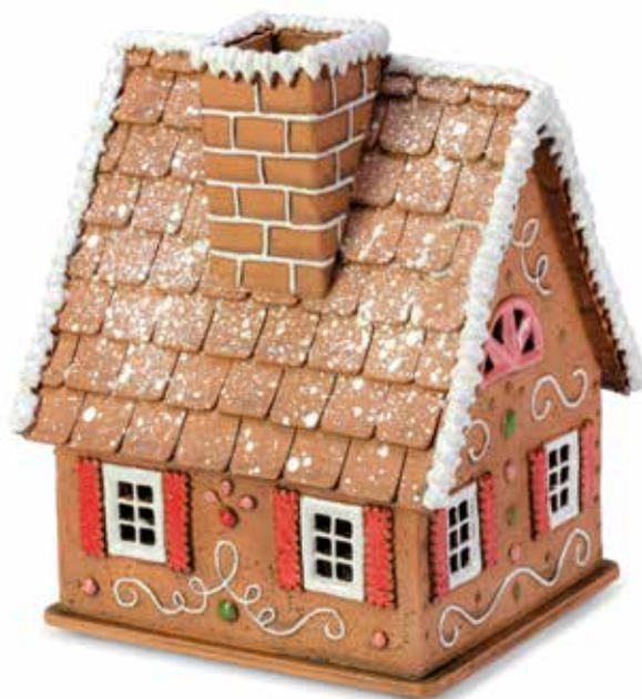
SW 09 16 cm