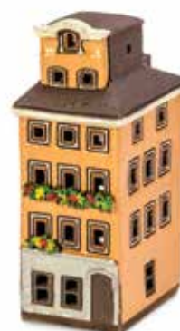
SW 03 MINI 10 cm