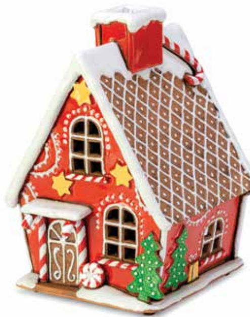
SW 08 17 cm